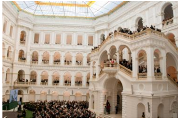
Warsaw University of Technology, Warsaw, Poland.

20-22 January 2016, Warsaw University of Technology, Poland