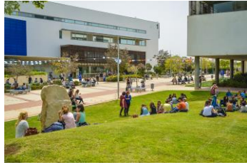
The Academic College of Tel Aviv Yaffo, Israel.

5-7 September 2017; The Academic College of Tel Aviv Yaffo, Israel