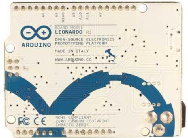
Arduino Leonardo Front with headers